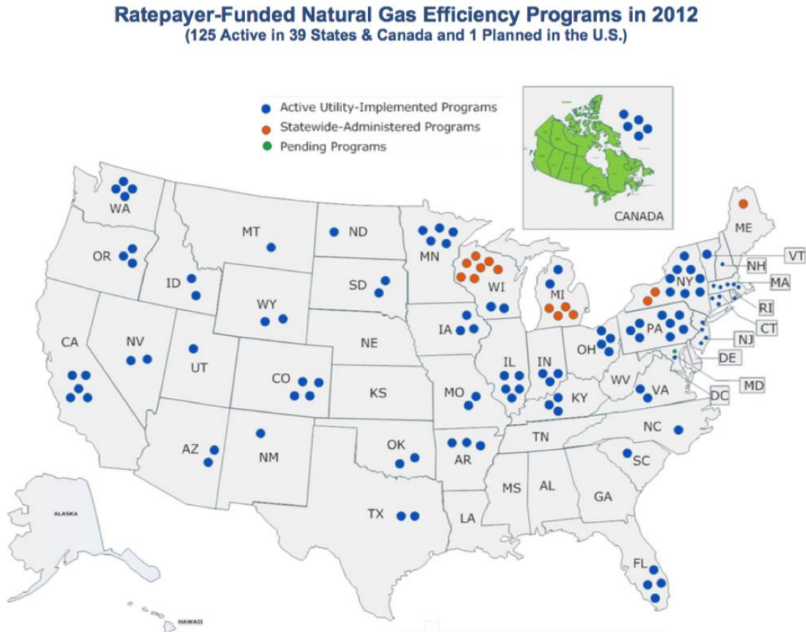
Figure 1. Spread of Natural Gas Energy Efficiency Programs 6

As the energy market is becoming increasingly customer driven, utilities around the country are recognizing the opportunity to drive economic growth and an efficient economy by sponsoring energy efficiency and conservation programs. For natural gas utilities, the opportunity to invest in helping customers save money, increase comfort, and reduce the impact they have on the environment is now a crucial component of joining the next generation of energy utilities and benefiting the communities that they serve.