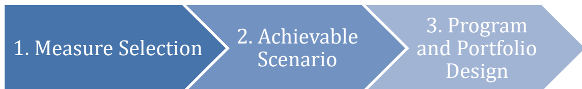
Figure 2. Plan Development Process

The UGI Gas EE&C Plan was developed in three stages, as shown Figure 2. The first stage involved the characterization of a wide range of natural gas efficiency measures and project energy savings and costs. Avoided costs for